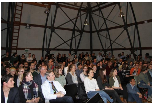
CNB Science Slam, 15. March 2017 – Brainweek Bern 2017