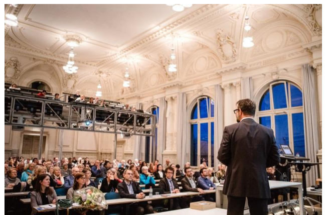
Opening Symposium, 13. March 2017 – Brainweek Bern 2017