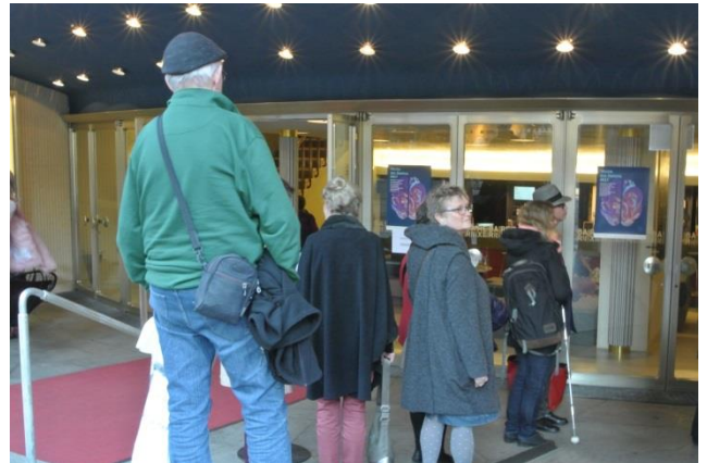
Movie Night “Alzheimer”, 15. March 2017 – Brainweek Bern 2017

The next Brainweek Bern will take place from the 12 th to the 16 th of March 2018. The preliminary program and further information as well as all programs of past events can be found on the Brainweek homepage: www.brainweekbern.ch