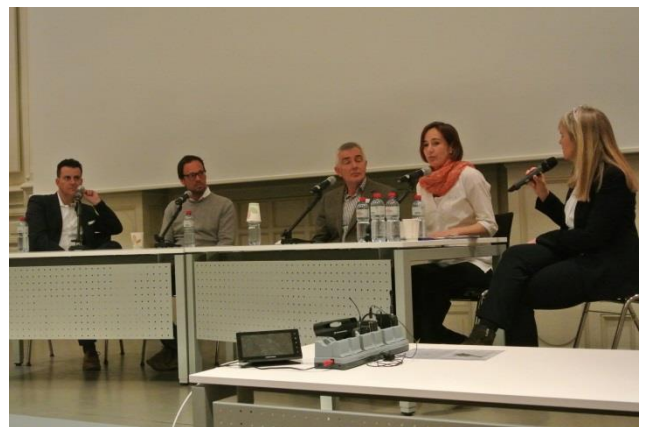
Symposium “brain injury”, 16. March 2017 – Brainweek Bern 2017