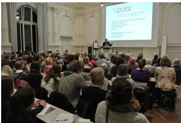
Symposium “Brain diseases”, 14. March 2017 – Brainweek Bern 2017