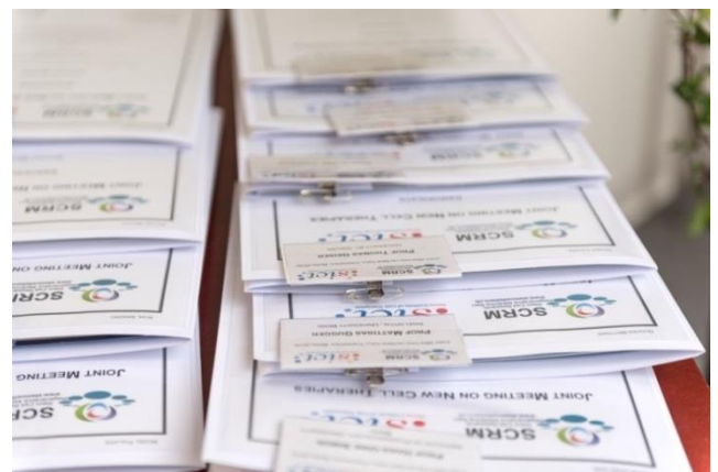
Impressions from the “Joint Meeting on New Cell Therapies” Bern, November 23 rd 2016

In conclusion, the SCRM Platform looks forward to an interesting and intense collaboration with CNB.